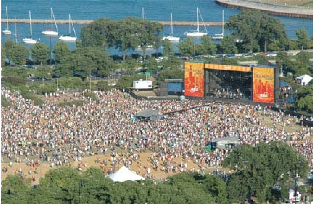
Fans can expect the action to start as early as 11:15 a.m. on Aug. 7 as the crazy schedule of acts performs until 10 p.m. each night. Other popular acts scheduled to perform throughout the

festival days include Ben Harper, Coheed and Cambria, Rise Against, Snoop Dogg, The Decemberists, and many more. As an added bonus for fans, or to kill time between desired performances, the f.y.e. Autograph Tent will also feature regularly scheduled appearances by various acts on the bill. Kings of Leon and Depeche Mode are scheduled to close out the action on Aug. 7 on separate stages while Tool and the Yeah Yeah Yeahs close out Saturday night. In what is sure to divide loyalties among rock music fans, Jane's Addiction and The Killers perform at the same time to close out the festival on Sunday night. Fans can purchase a regular 3-day pass for $205 at lollapalooza.com . Single-day passes are also currently available for $80 each. For more on Lollapalooza, including ticketing and schedule info, log on to lollapalooza.com .